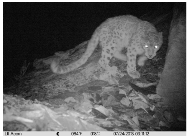
Fig. 2. Snow leopard emerged along KKH in KNP.